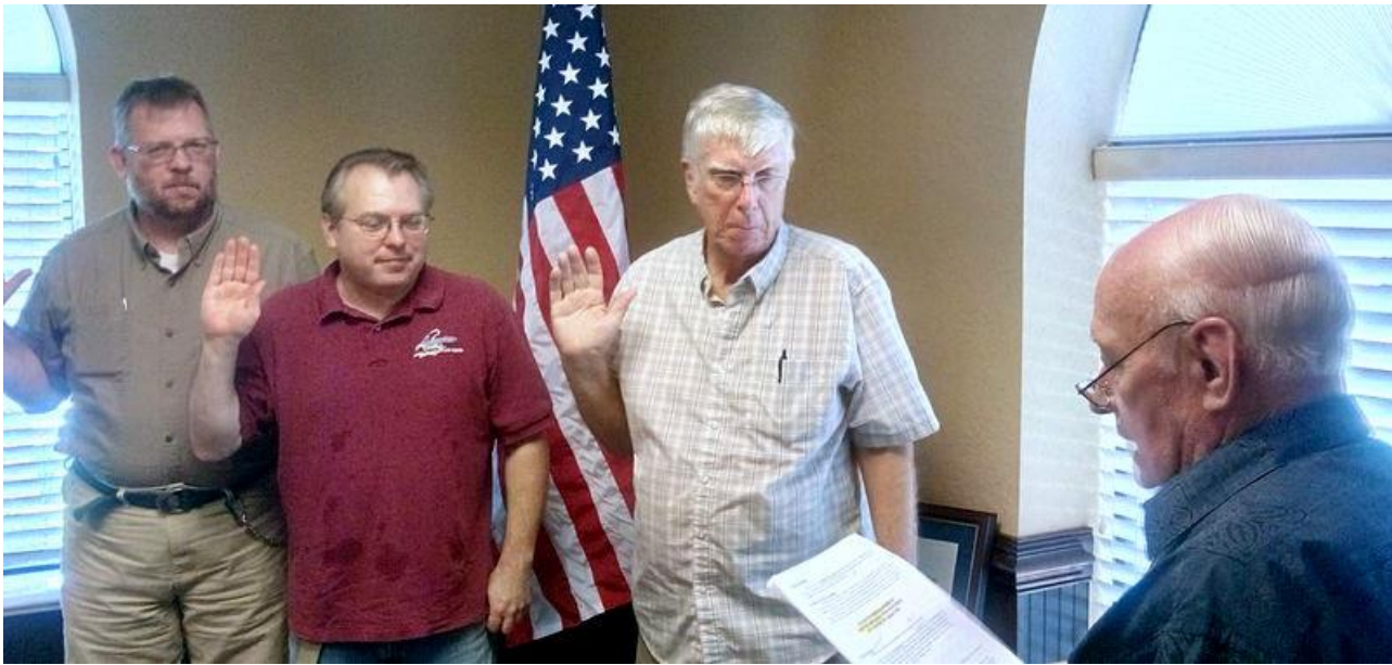
SAR Officers being sworn in for the coming year of 2014-2015.

Meet some of our members that attended our last Business Meeting.